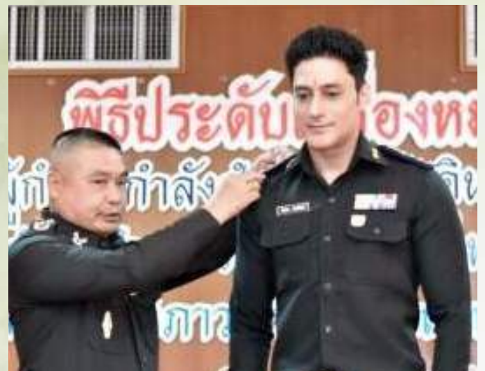
Honour from General Chanathip, Thailand