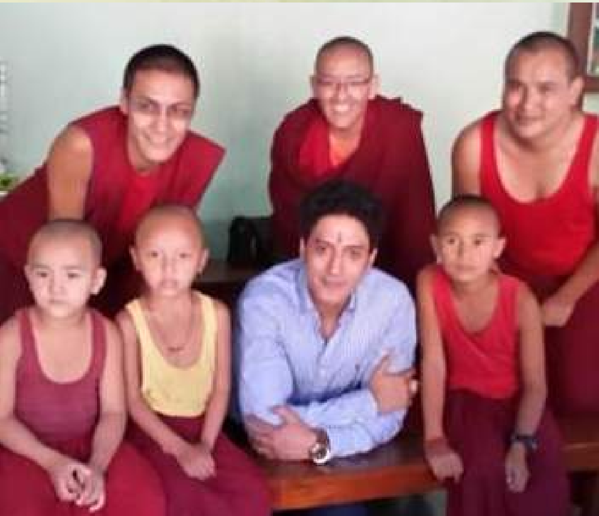
Buddhist Monastery Hubli, Karnataka, India