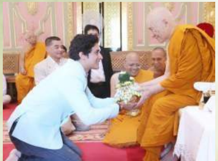
The Supreme Patriarch of Thailand Sangharaja Somdet Phra Sangkharat Sakonlamahasangkhaparinayok.