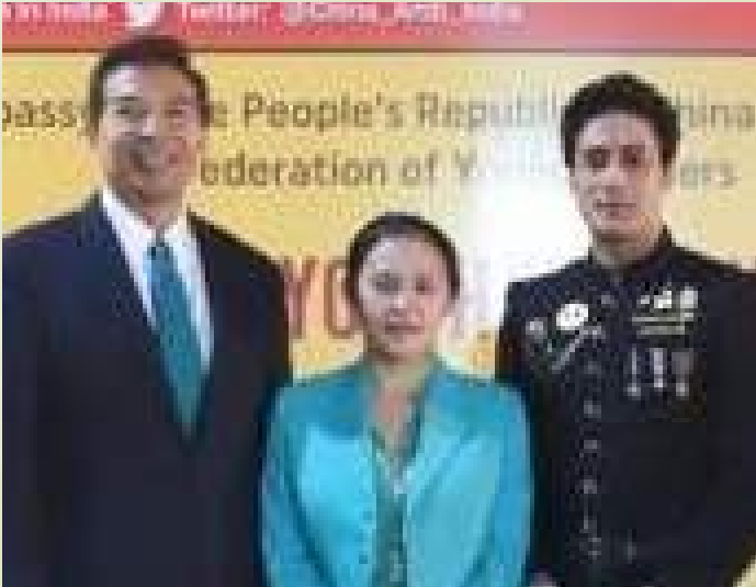
With Former cultural and sports and his wife