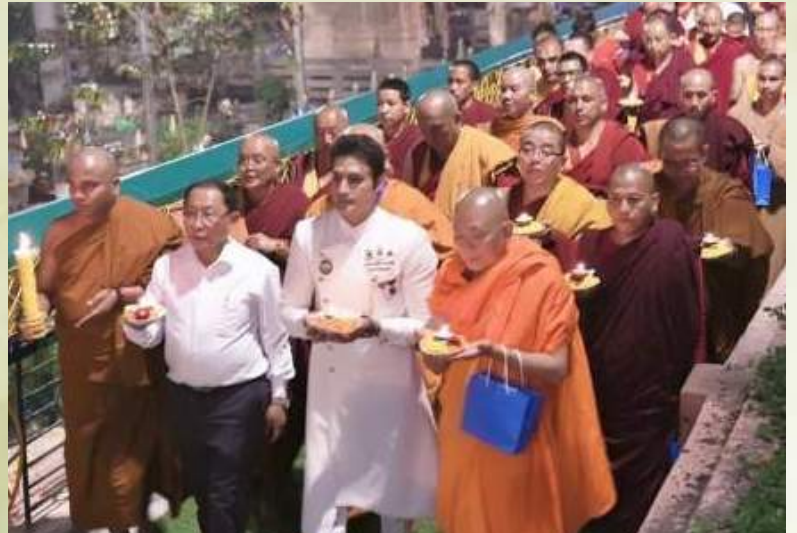
Peacewalk with Mahasangha