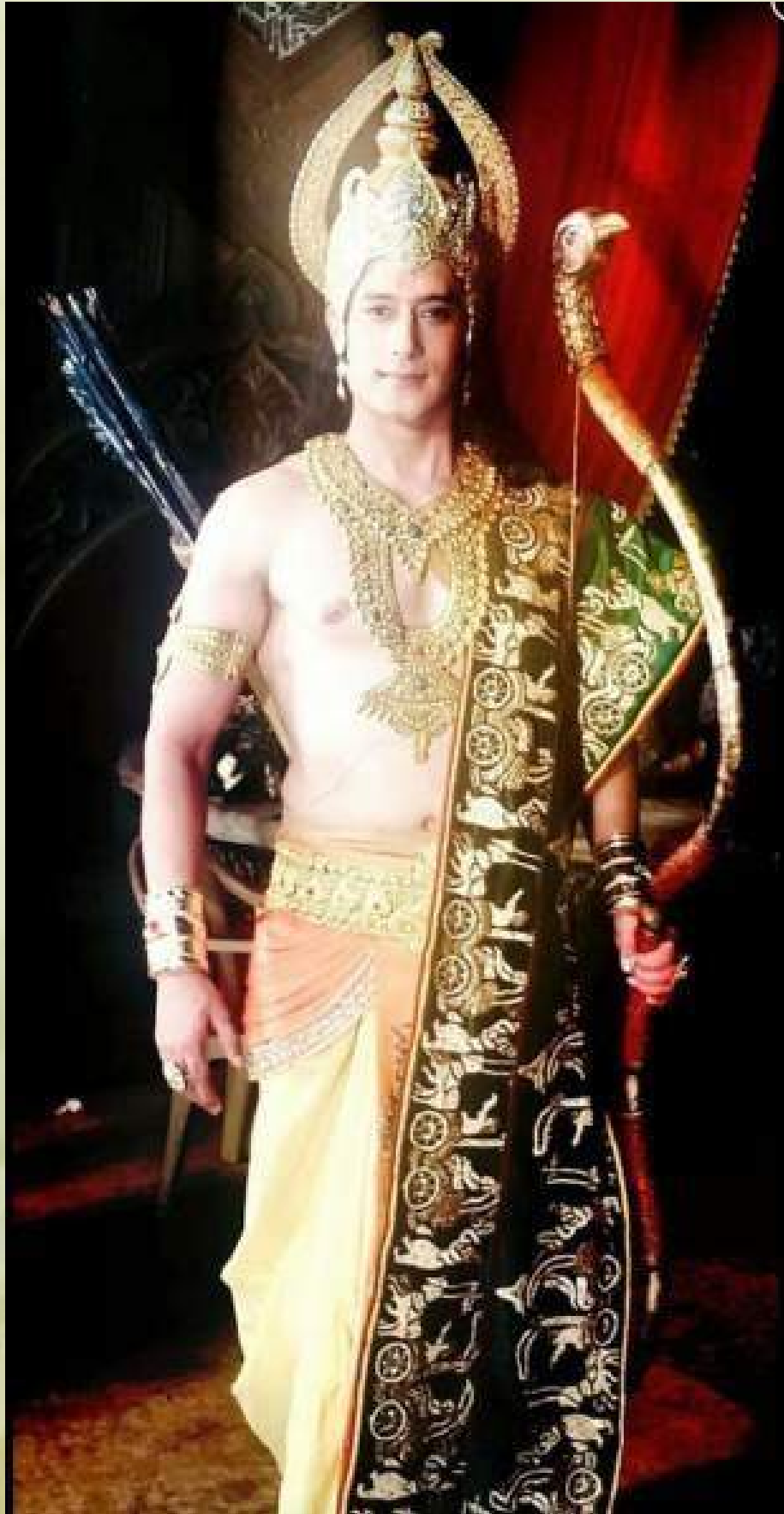
As Lord Ram in Sankat Mochan Mahabali Hanuman Tv series.