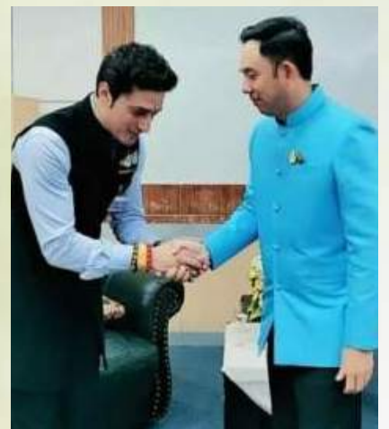
With Minister of Culture. H.E Itipol Khunpluem, Thailand