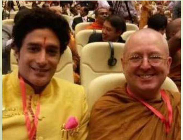
With Most venerable Ajan Brahm, Australia