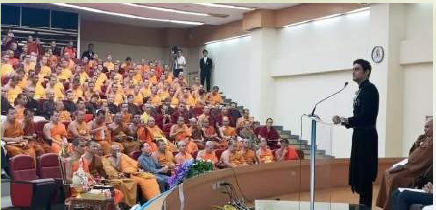
Speech at Mahachulalongkorn University, Thailand