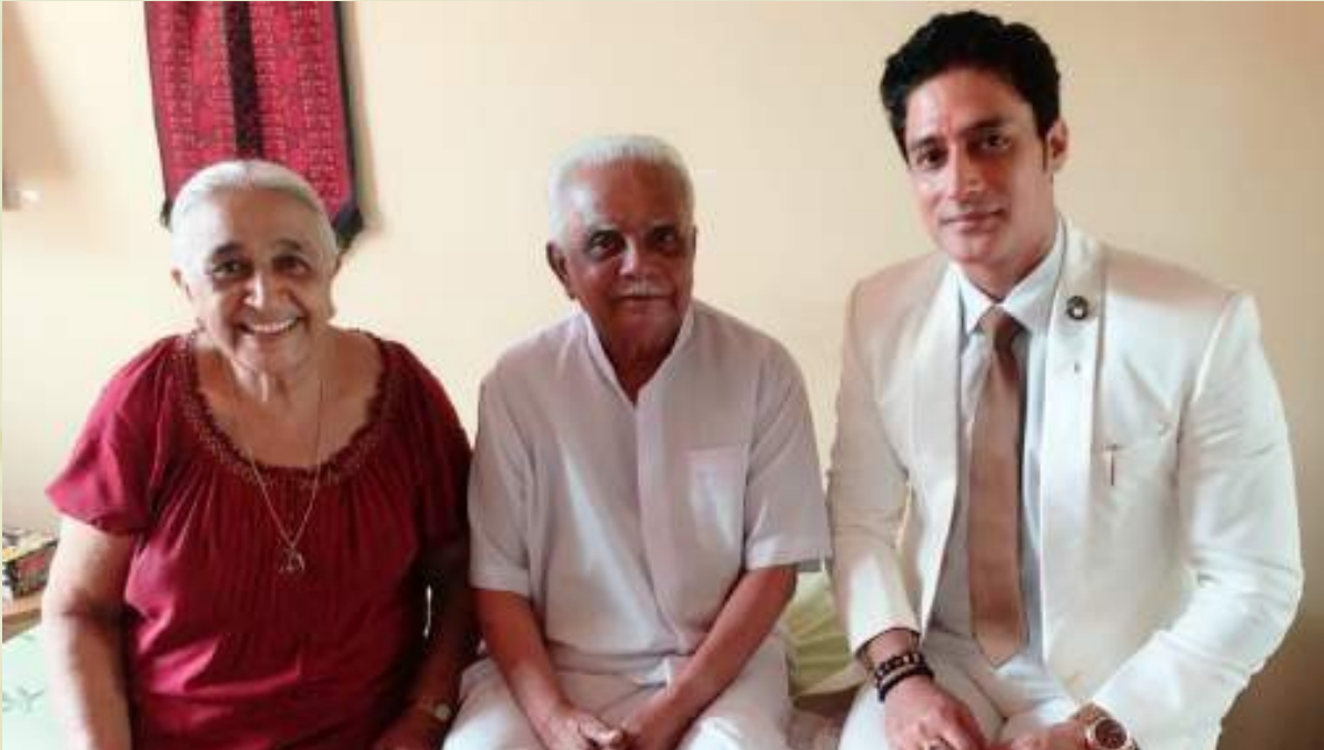
With Dr. A.T Ariyaratne President Sarvodaya Foundation, Srilanka