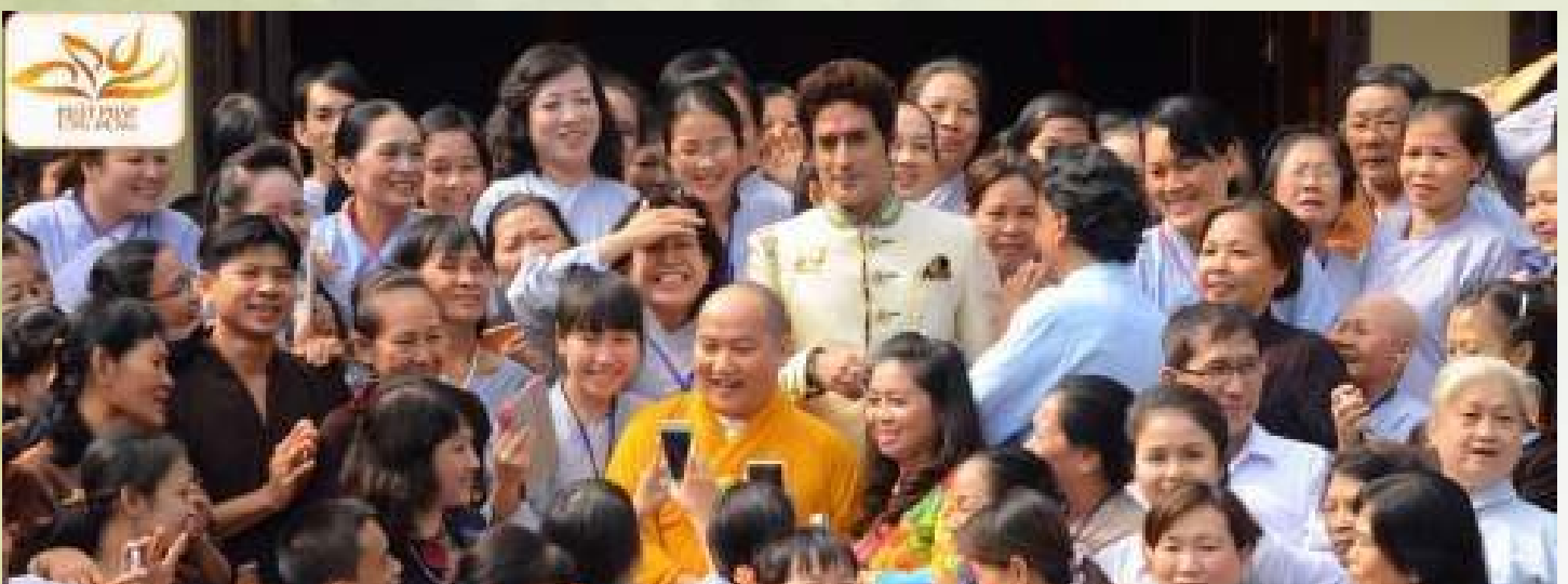
With Fans in Vietnam