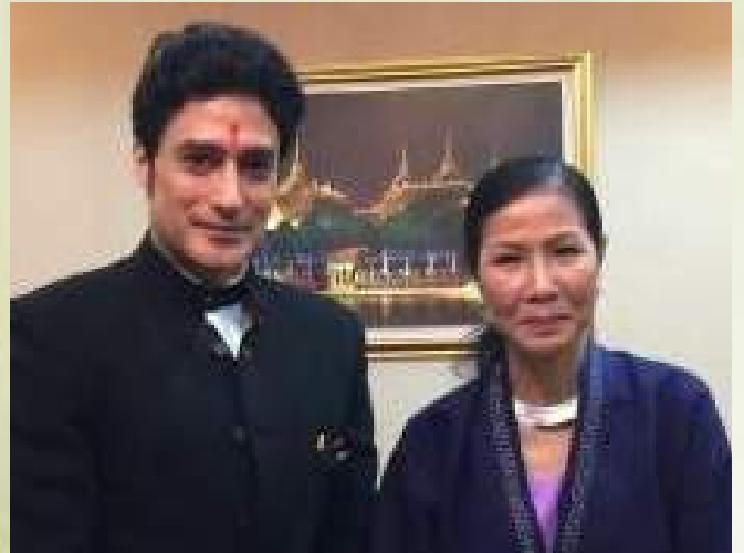
With Former cultural and sports Minister of Thailand