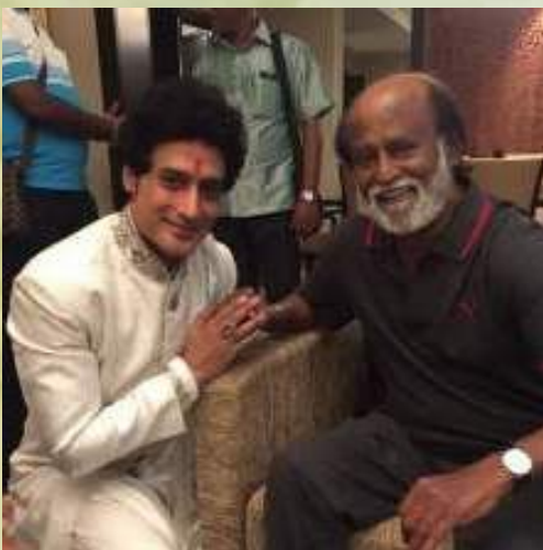
With Super Star Sir Rajinikanth