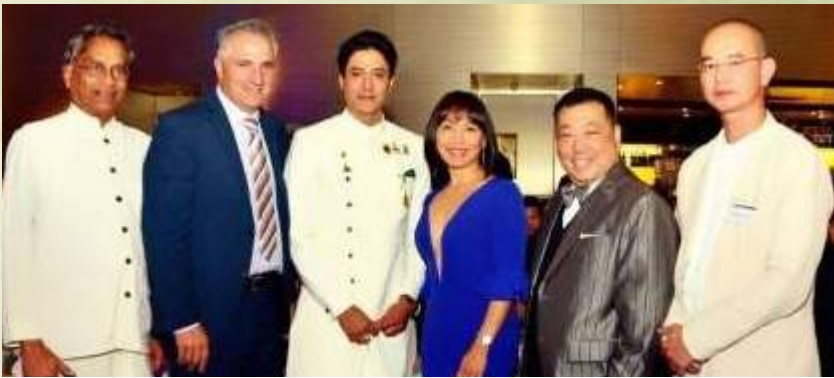
With Mayor of Sydney and Principal of Pal Buddhist School, Australia