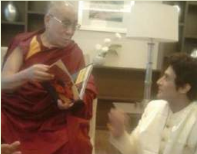
Discussion with His Holiness The Dalai Lama