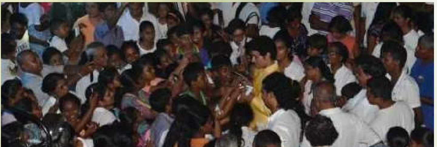
With Fans in Sri Lanka