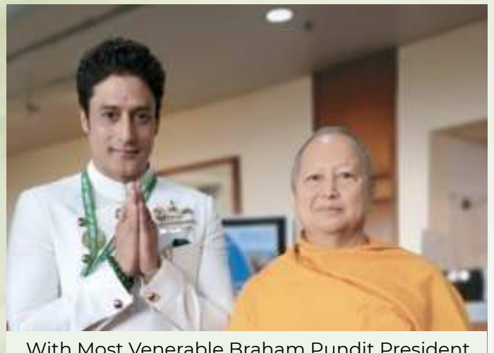
With Most Venerable Braham Pundit President of United Nations day of Vesak organization