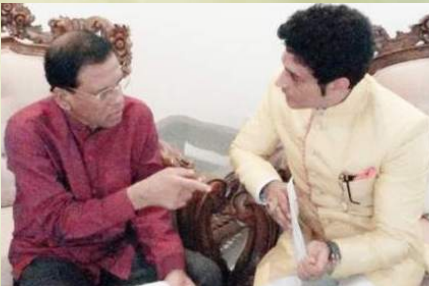
With Former President of Sri Lanka: Hon. Maitripala Sirisena