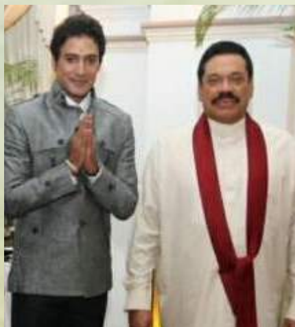
With Hon. Prime Minister of Sri Lanka Shri Mahinda Rajapaksha