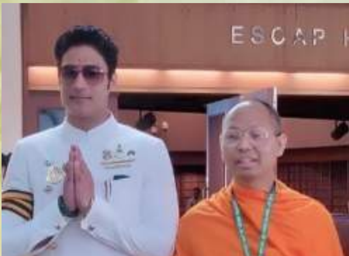
With Venerable Somboon, Sweden