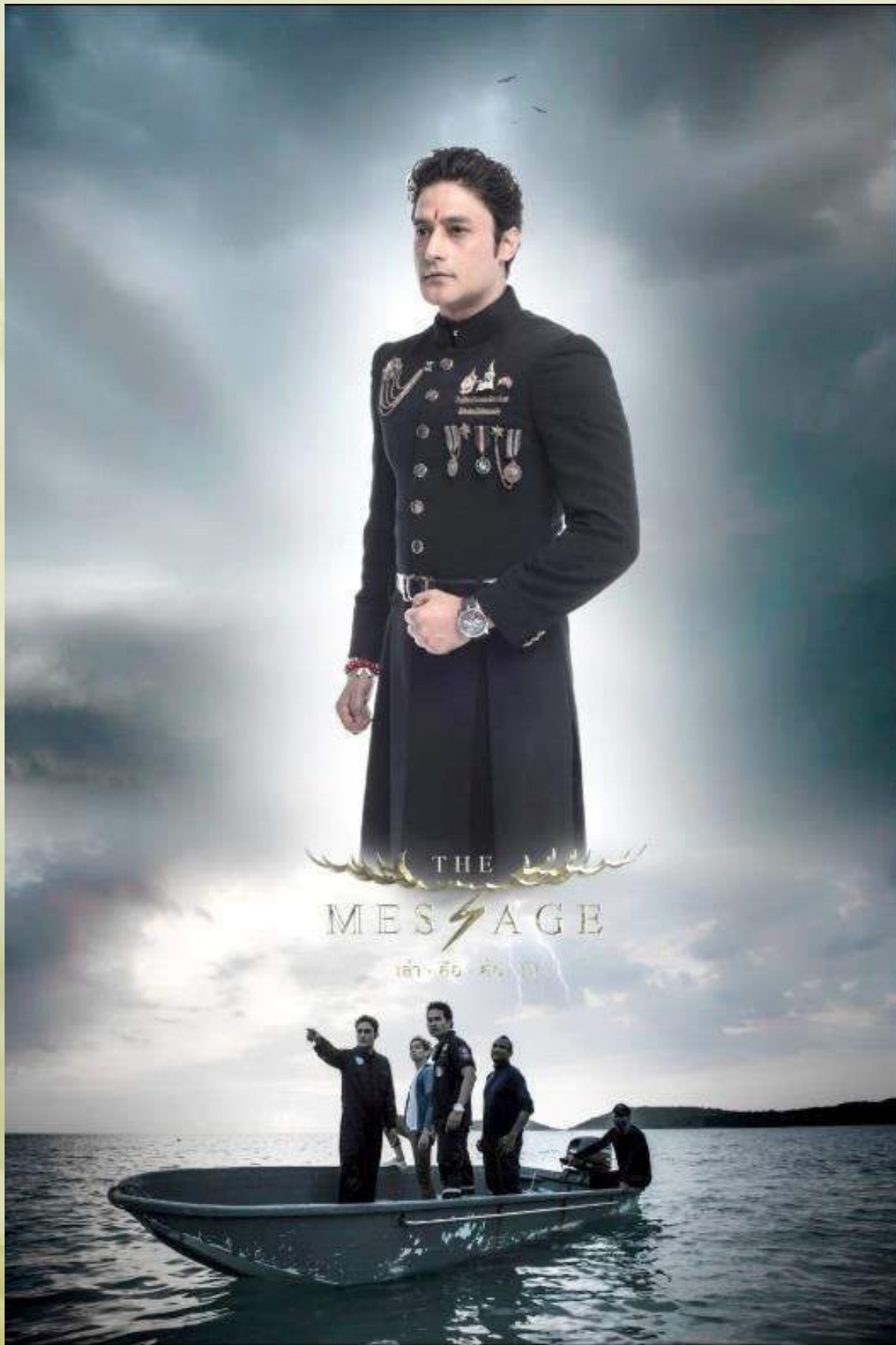
At the beginning of 2020, his latest movie “The Message” was released in Thailand.