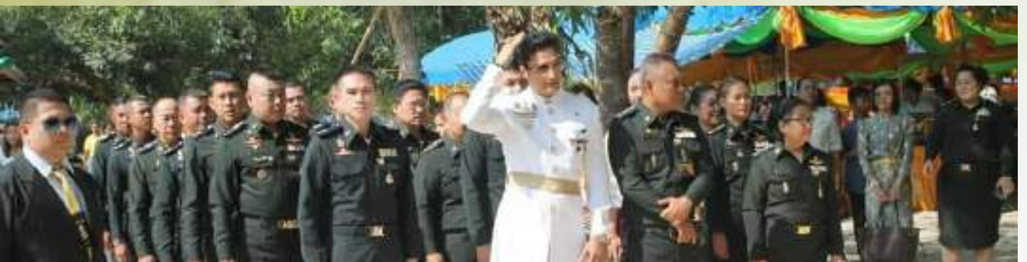
Parade with Thai Army