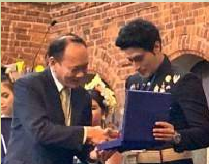
With Ambassador of Thailand in Sweden