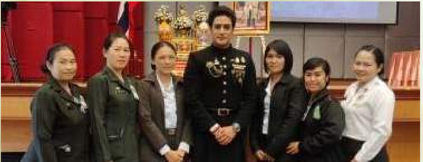
With Army officers in Thailand