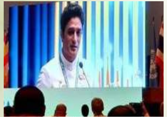
Speech at United Nations Thailand